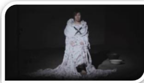
Still from "Treaty Number Three" By Danielle Sturk