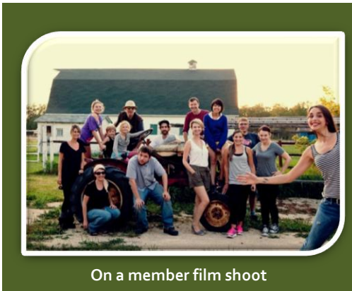
On a member film shoot