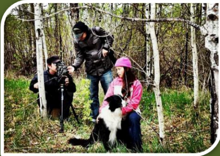
On a member film shoot