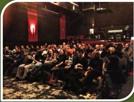
Member Premieres at The Park Theatre