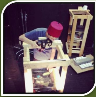
Teen Filmmaking Workshop