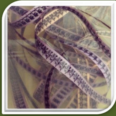
Hand processing workshop