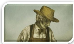
Still from "Fraction" by Alain Delannoy