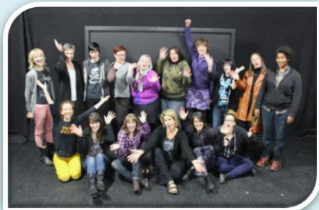
DIY Filmmaking for Women Workshop Participants