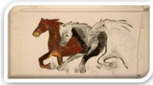
Still from "Empty" by Jackie Traverse