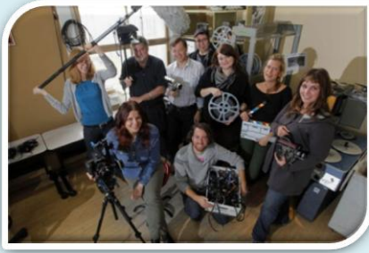
Winnipeg Film Group Staff