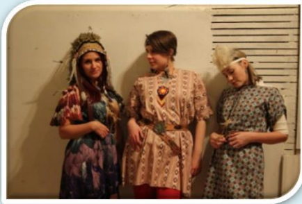
Still from "Maiden Indian" by The Ephemerals