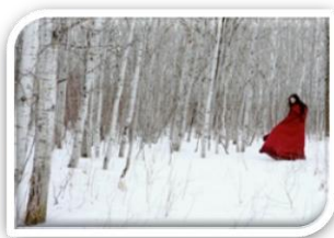
Still from "The Red Hood" By Danishka Esterhazy