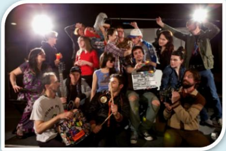
Bands vs Filmmakers 2012 Artists