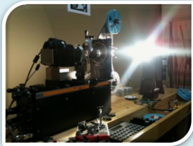
The Optical Printer in the Production Centre