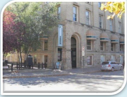
Winnipeg Cinematheque Outdoor Signage