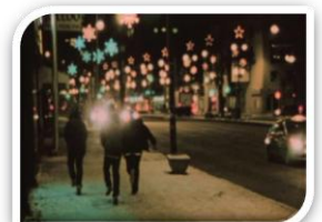
Still from "Semi-auto Colours" By Isiah Medina