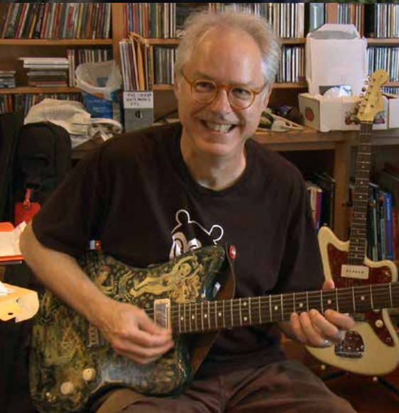
Bill Frisell: A Portrait