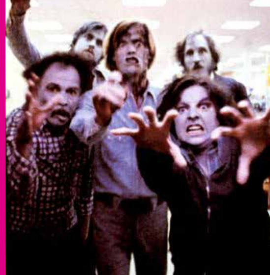
Dawn of the Dead