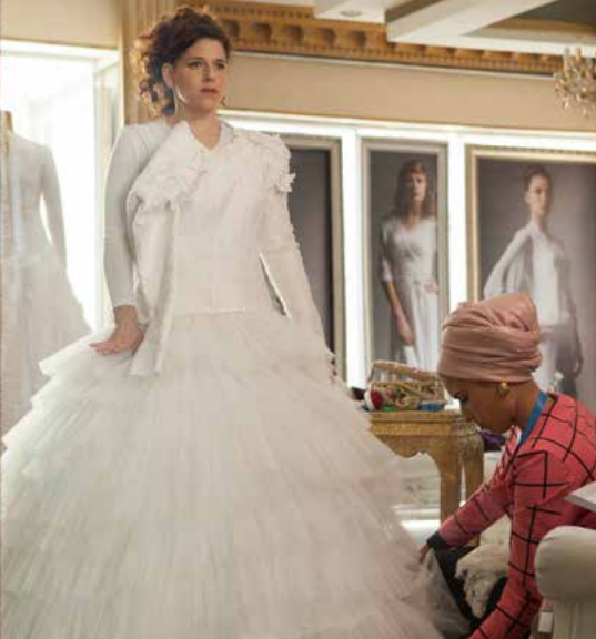
The Wedding Plan