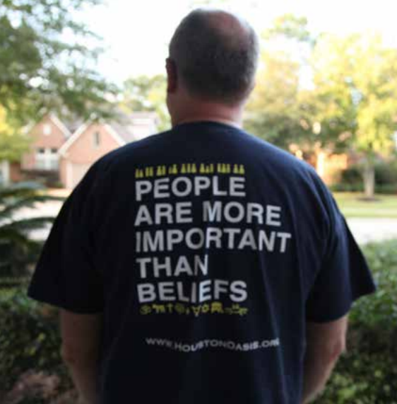
Losing Our Religion