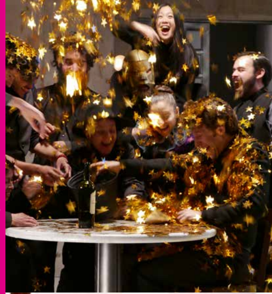
Endless Poetry (Poesía sin fin)

The late George Romero created many brilliant horror films but none as ferocious as Dawn of the Dead , his follow up to his 1968 debut, Night of the Living Dead . As we pick up the story, four survivors hijack a helicopter and escape to a suburban shopping mall where they stock up on supplies to face the impending zombie apocalypse.