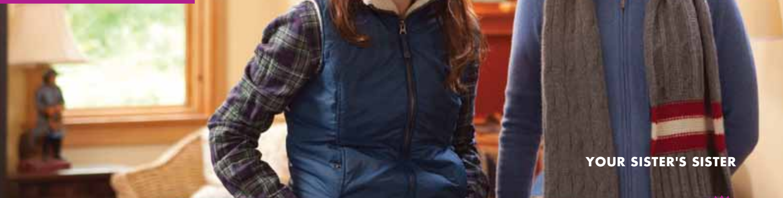
YOUR SISTER'S SISTER