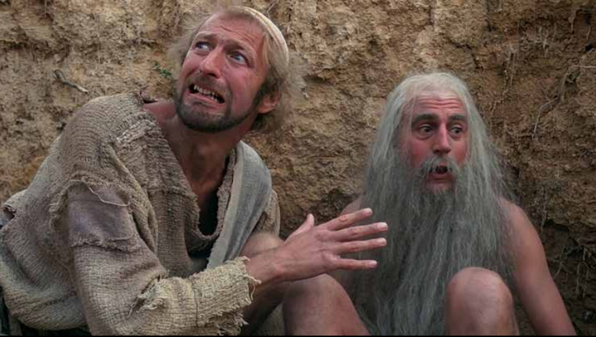
Life of Brian