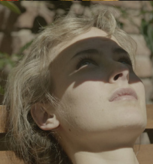
Still Night, Still Light