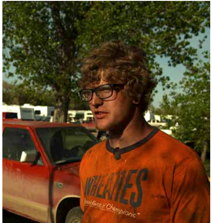
↑ The Overnighters

The Party / Dir. Robert Altman, 1966, USA, 4 min / Exploring the age-old theme of "revelry" threaded throughout Altman's life and work.