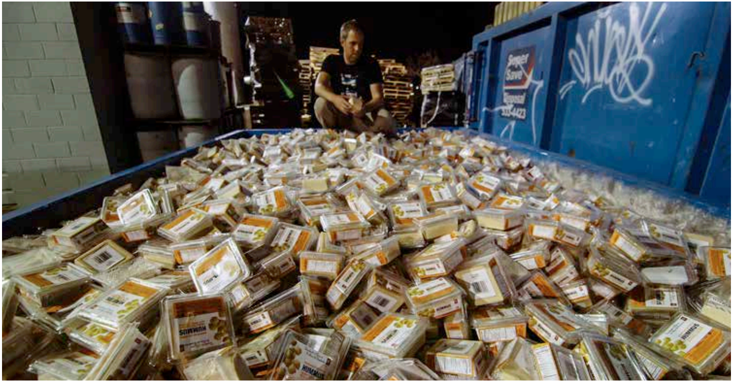
♦ Just Eat It: A Food Waste Story