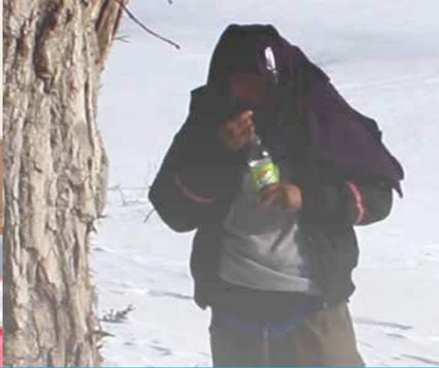
↳ Letters to Our Children: Stories of Refuge