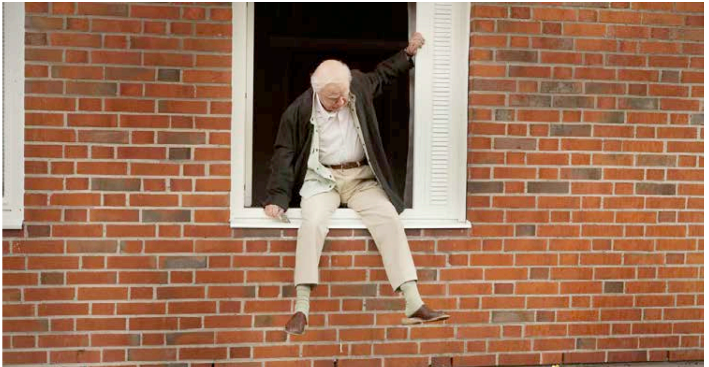
♦ The 100-Year-Old Man Who Climbed Out the Window and Disappeared