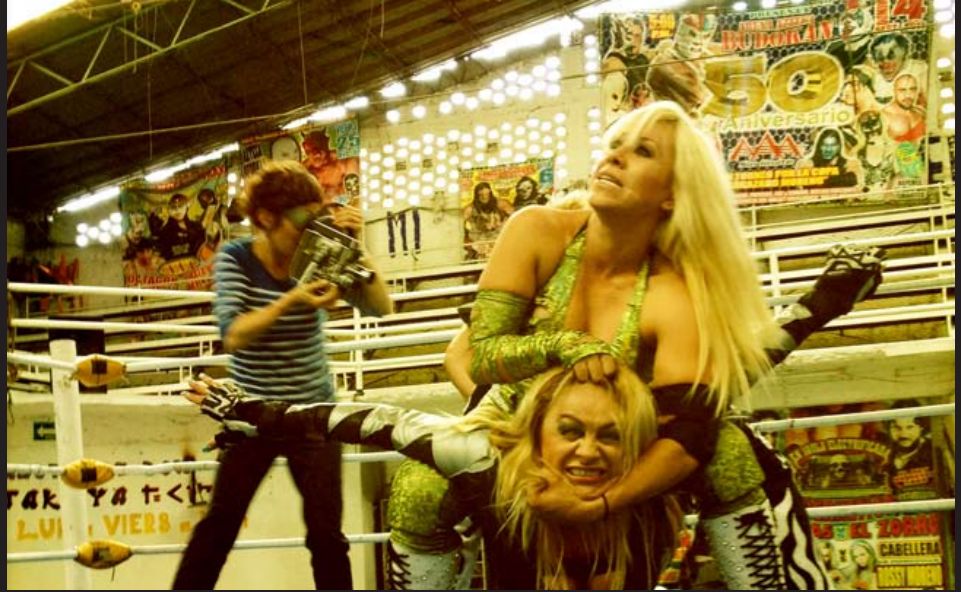
↑ Bim, Bam, Boom, Las Luchas Morenas