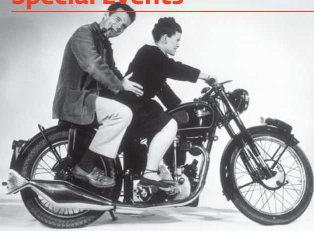
↑ Eames: The Architect and the Painter