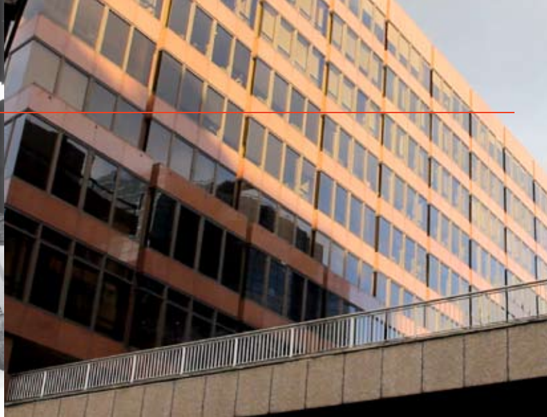
↑ The Pedway: Elevating London