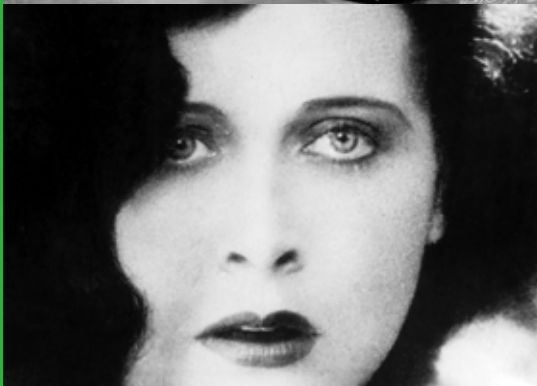
Bombshell: The Hedy Lamar Story