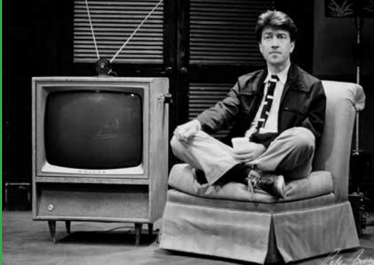
Blue Velvet Revisited

Hollywood wild-child, Hedy Lamarr, was infamous for her marriages and affairs with everyone from Spencer Tracy to JFK. After inventing the movie sex scandal, she married a Nazi collaborator, escaped him, and fled to Hollywood. Songs were written about her beauty and Snow White and Cat Woman were modelled on her iconic look. This documentary will rediscover her, not only as an actress, but as a brilliant mind. It turns out "the most beautiful woman in the world" was also a secret inventor. In the midst of World War II, she used her free time to help create a radio-control technology for torpedoes, technology which would ultimately pave the way for secure cellphone communication, WiFi, Bluetooth, and drone warfare. This is the story of an actress, admired for her beauty and ridiculed for her wild life, who was secretly a genius who changed the world.