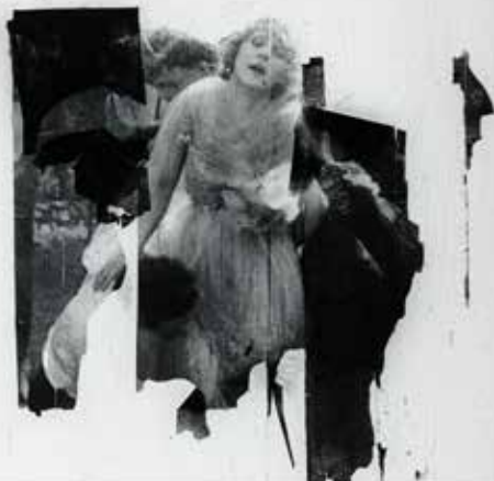
Dawson City: Frozen Time