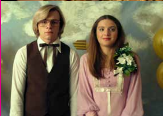
My Friend Dahmer