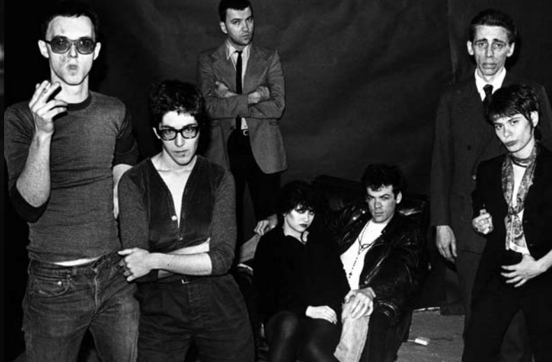
↑ Blank City