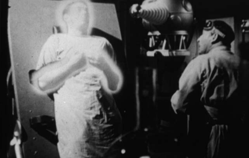
↑ Spectres of The Spectrum