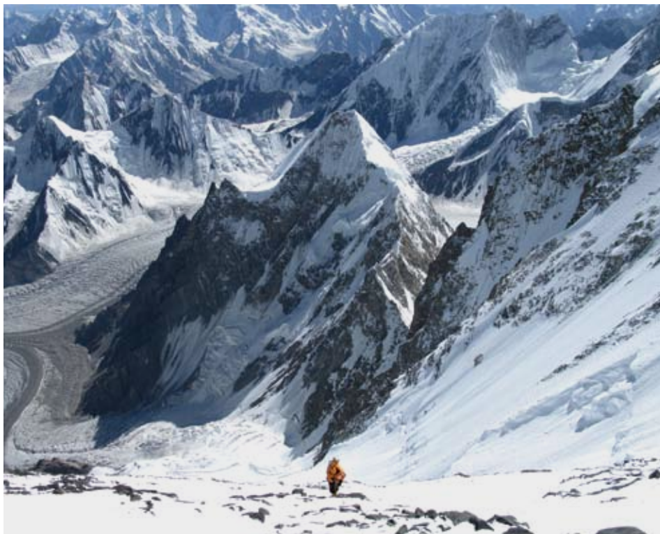
↑ The Summit