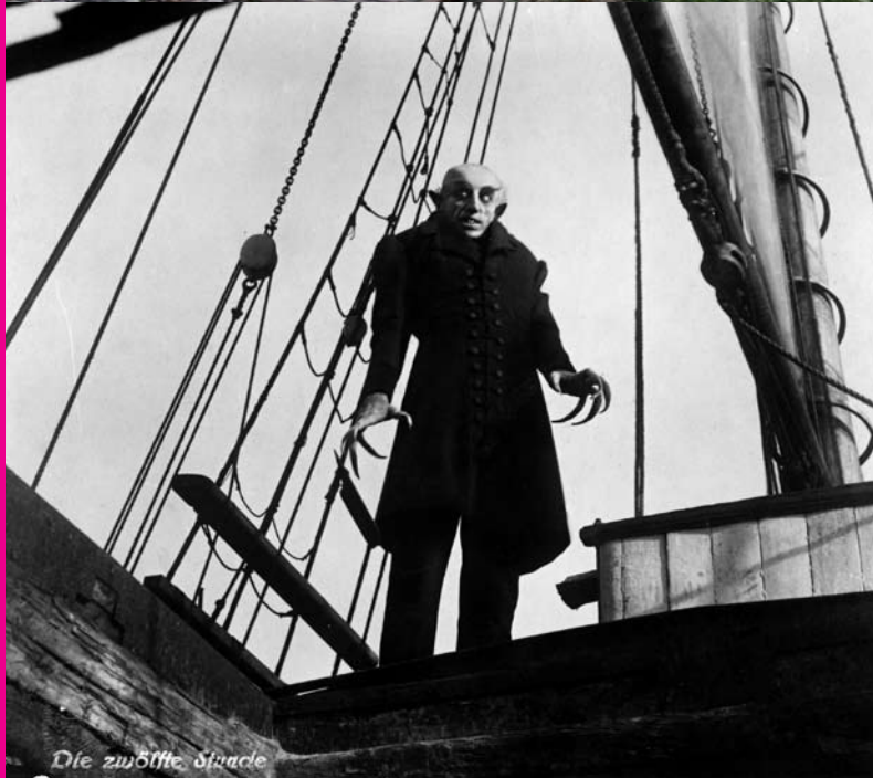
Die zwölfte Stunde