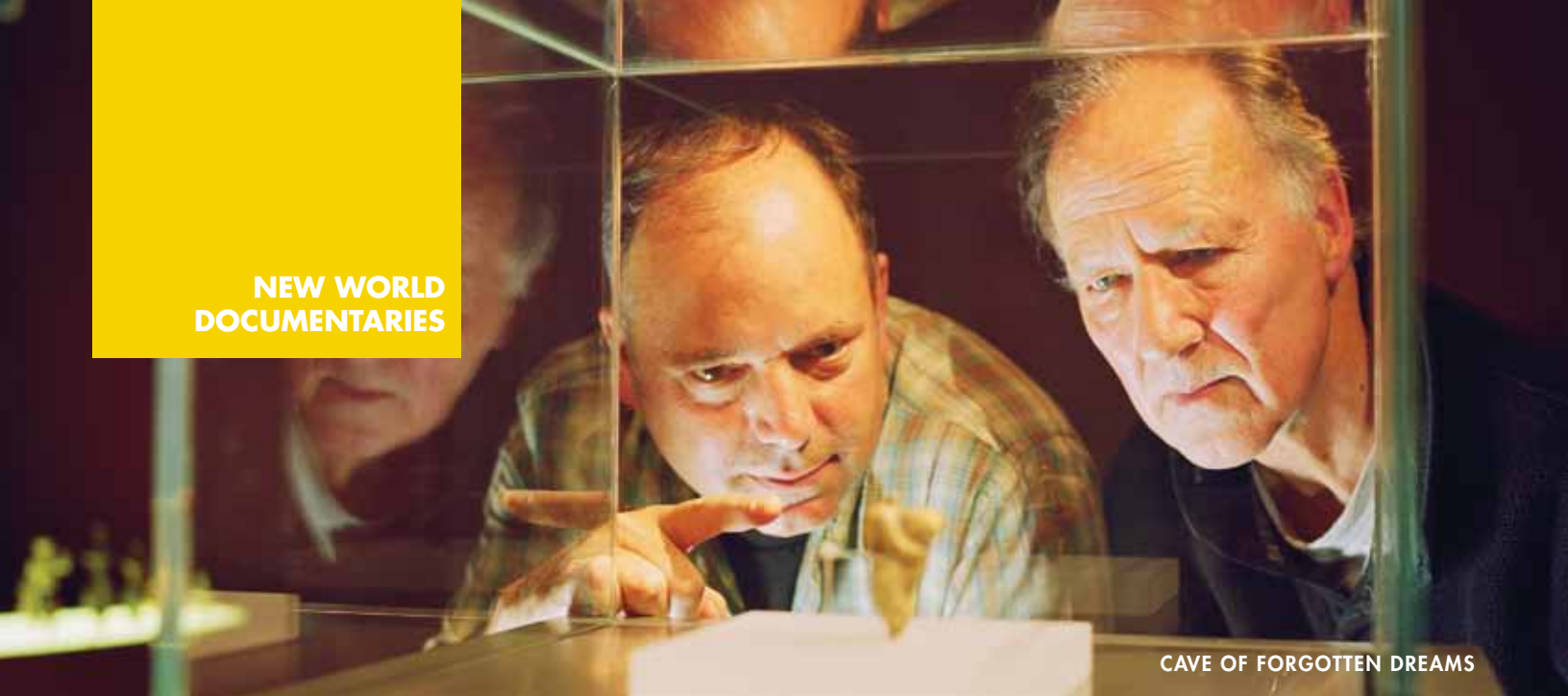
CAVE OF FORGOTTEN DREAMS